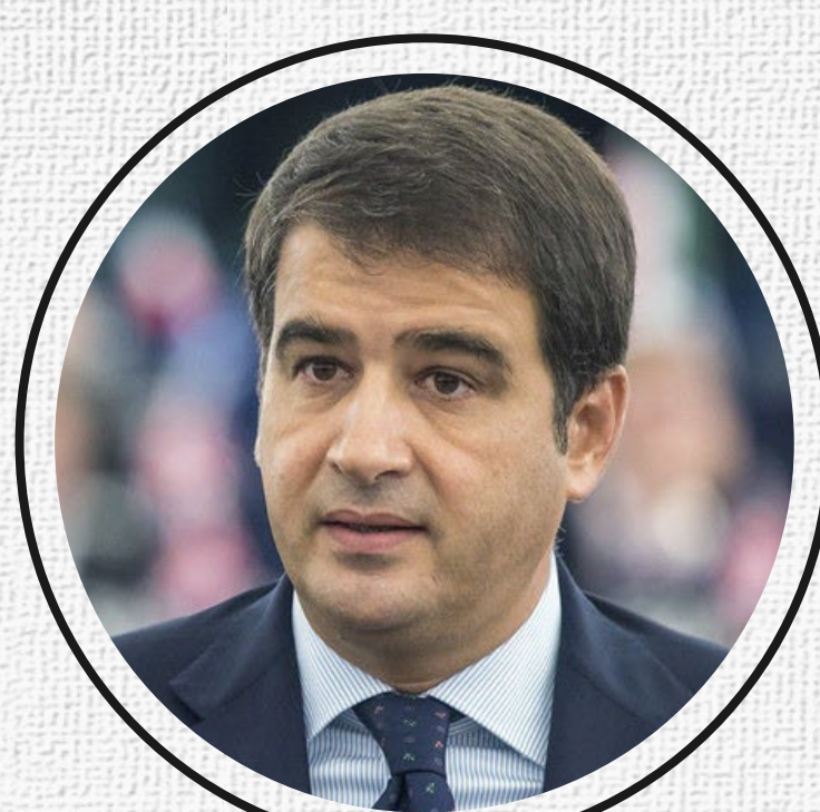
Raffaele Fitto MEP